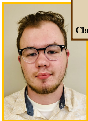
Timothy Trepal $1,500 Class of '61 Scholarship